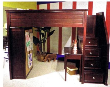
Powell's Maximus loft bed is flexibly configured to accommodate a workstation.

Twin-Star has been adding office desks in contemporary styles and white finishes for a modern look and smaller living spaces.