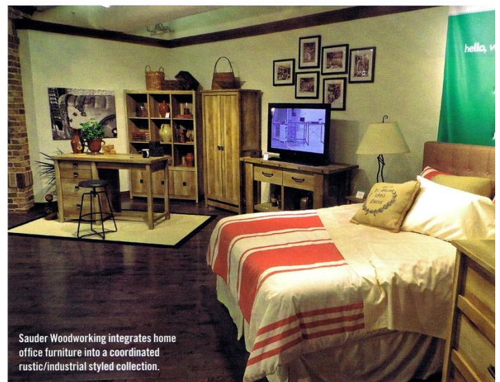
Sauder Woodworking integrates home office furniture into a coordinated rustic/industrial styled collection.