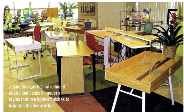
Z-Line Designs has introduced chairs and desks in modern styles that use lighter finishes to brighten the home office.